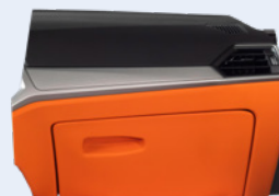
BMW 7 Series Glove Box