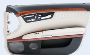
Mercedes S-Class Door Panel