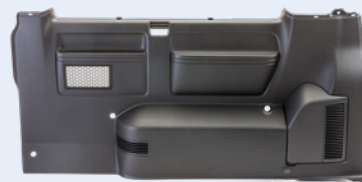
VW Caravelle T6.1 Sidewall Trim